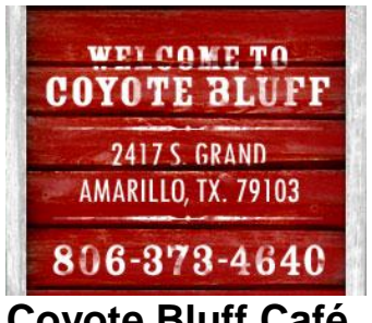
Coyote Bluff Café